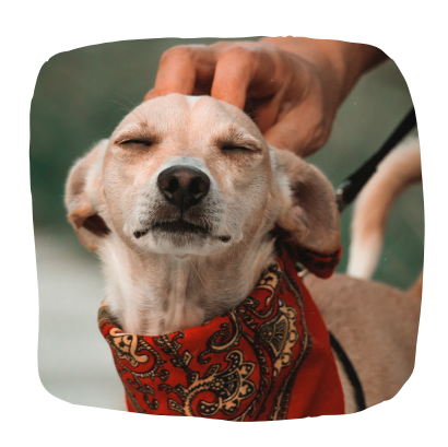
OVER 6.765 POUNDS OF FOOD AND SUPPLIES PROVIDED